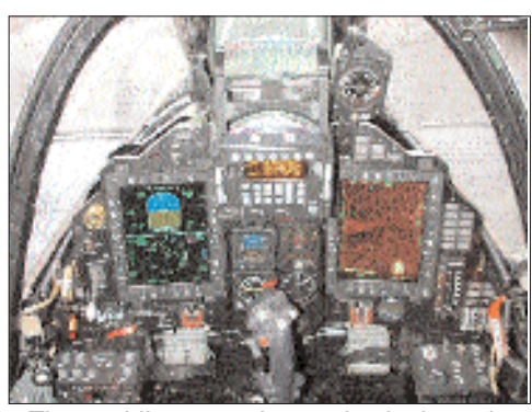
The world's most advanced avionics suite

Delivery and Navigation System (WDNS). The upgraded Su-25 "Scorpion" made its official maiden flight on April 18 of this year, at the TAM airfieldin