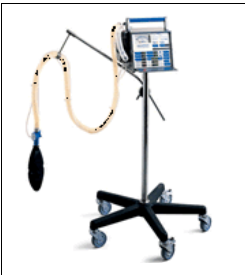
Flight Medical's Ventilator is Creating a Stir in the US

Medax 2001 was the 14th Israel Medical Week, when scores of medical equipment suppliers exhibited their wares to visitors. Concurrently, a tremendous variety of papers on medical